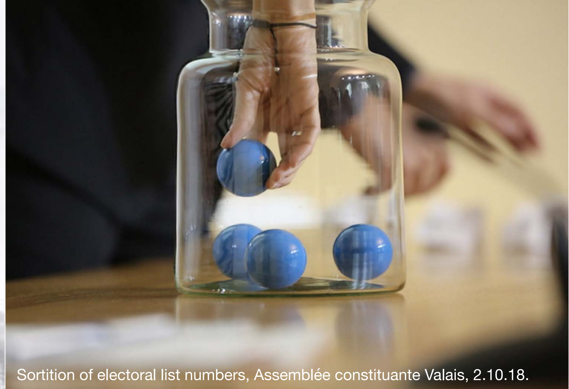
Sortition of electoral list numbers, Assemblée constituante Valais, 2.10.18.